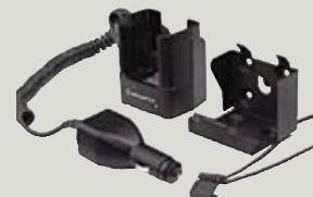
RLN4883 Travel Charger