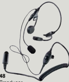
RMN4048 Temple Transducer