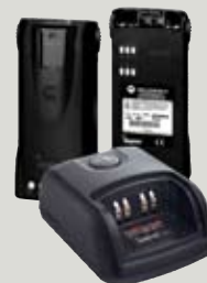
impres™ Smart Energy System