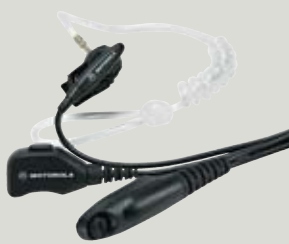
PLMN4607 Surveillance Kit with Clear Acoustic Earpiece

Motorola accessories are built with the highest quality standards and are specially engineered to ensure maximum performance for your radio, no matter what profession you're in.